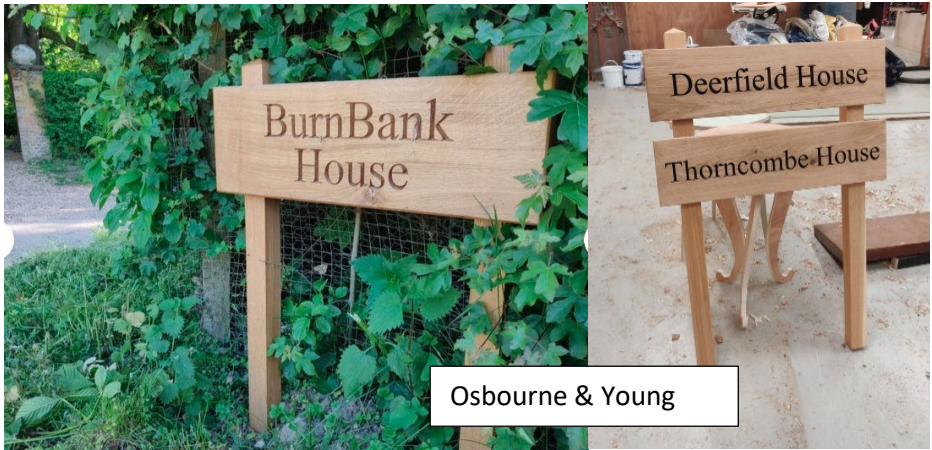
Osbourne & Young