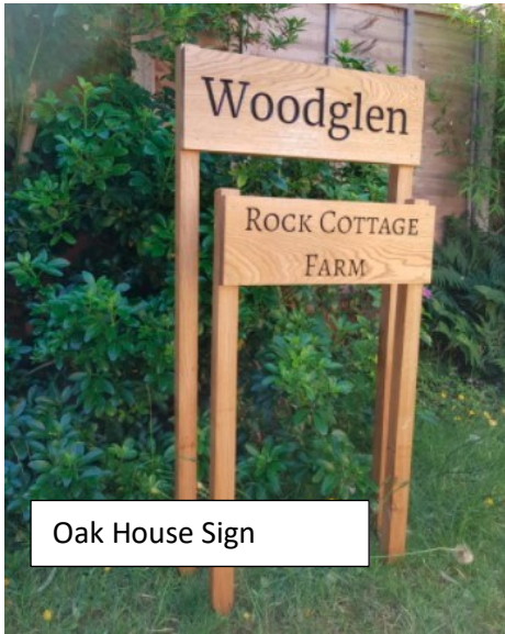
Oak House Sign