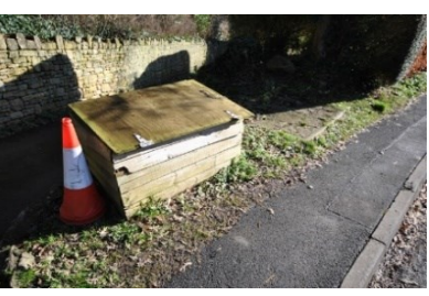
15 January 2021 Bench removed in 2019 and not replaced